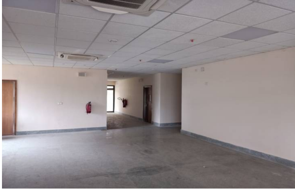
Corridor Area at Ground Floor