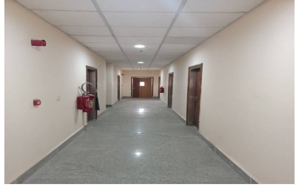
Corridor Area at Ground Floor